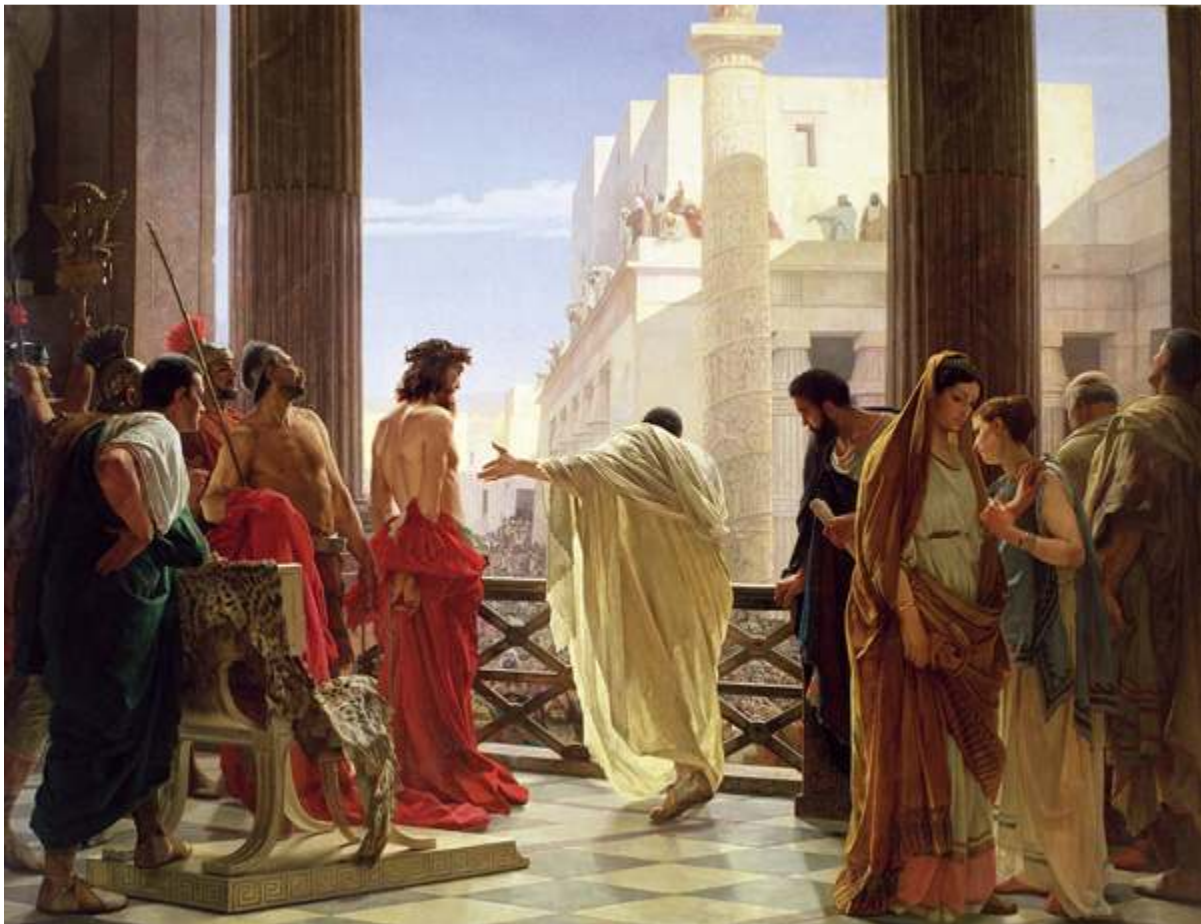
Figure 1 - Ecce Homo (Behold the Man!) by Antonio Ciseri, 1871, Galleria dell'Arte Moderna, Palazzo Pitti, Florence.

The Swiss-Italian painter Antonio Ciseri captured the moment that Pilate displayed Jesus to the angry mob, declaring, “Behold the Man!”