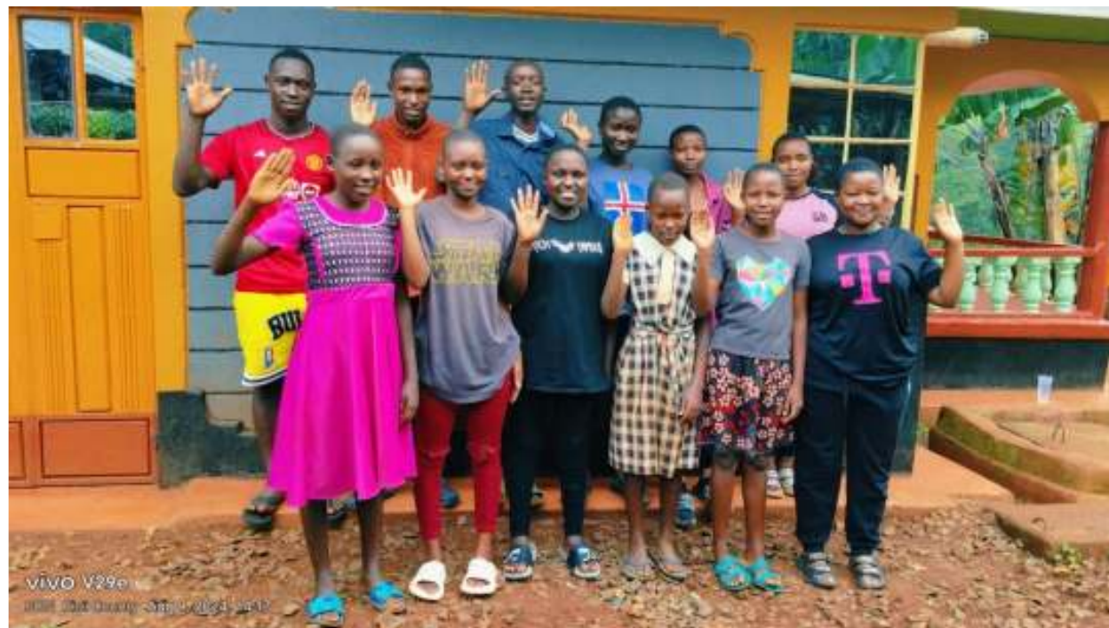
Sengera House Orphans.

I also received some letters of thanks from the orphans at Sengera House. They have been home between semesters for three weeks, and now are headed back to School on Monday the 26 th of August.