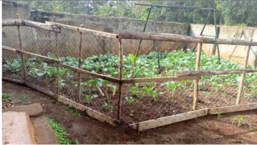
Garden at the camp.