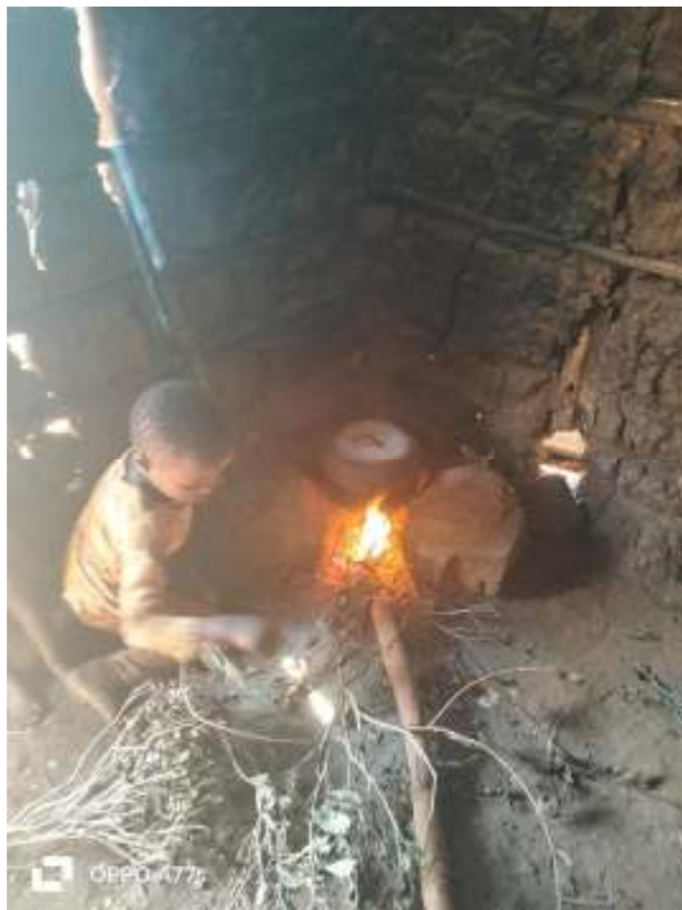
Young Elves preparing food.

Your support is helping our impoverished brethren so much. Below is a picture of orphan Elves cooking food. As you can see their living conditions are a bit rough. But thanks to you, they are doing well. And they appreciate your help very much.