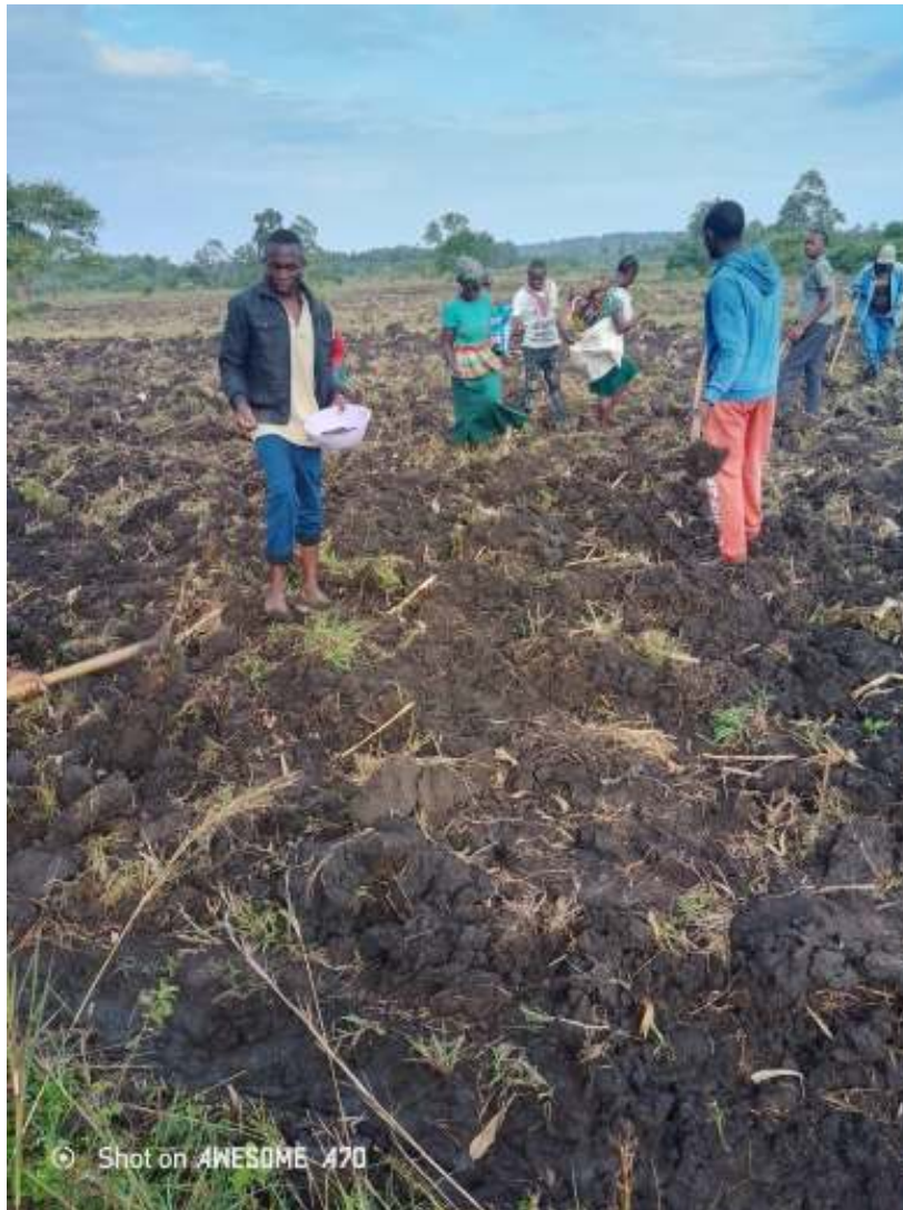
Here the brethren are planting maze and beans.