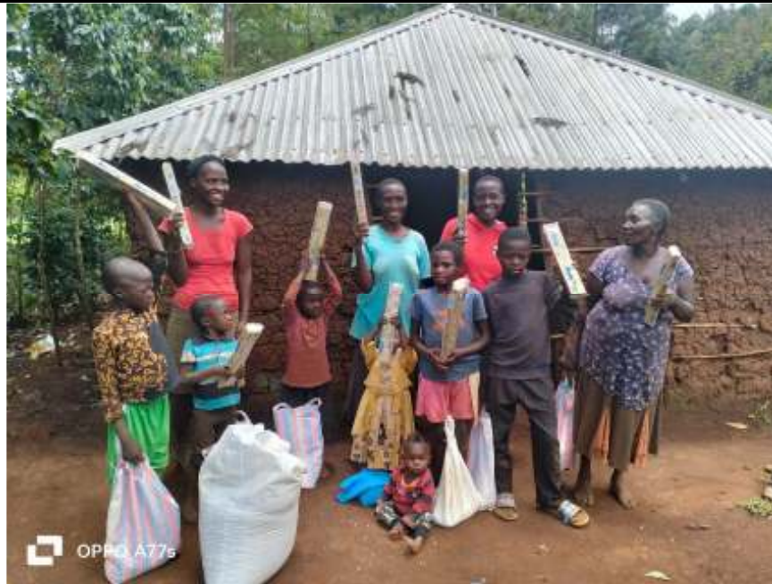
Orphans and widows receiving maize, beans, and soap.

Your support is helping our impoverished brethren so much. Below is a picture of orphan Elves cooking food. As you can see their living conditions are a bit rough. But thanks to you, they are doing well. And they appreciate your help very much.