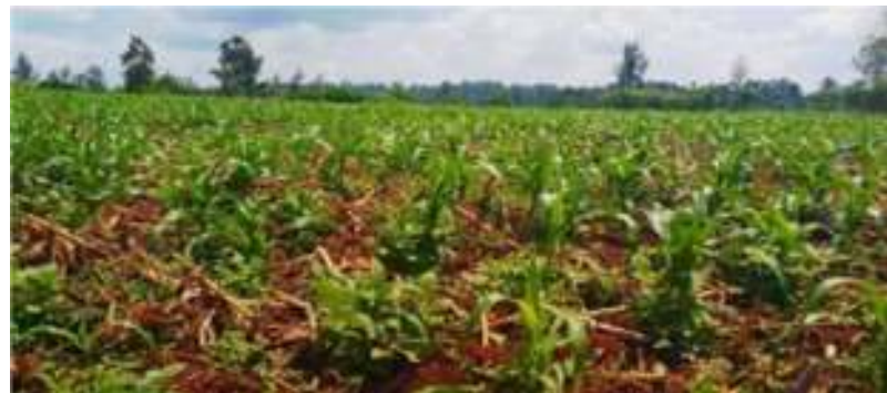
KHOFH – Kenya Hands of Hope

The October 1, 2024, update is now posted at: KHOFH – Kenya Hands of Hope