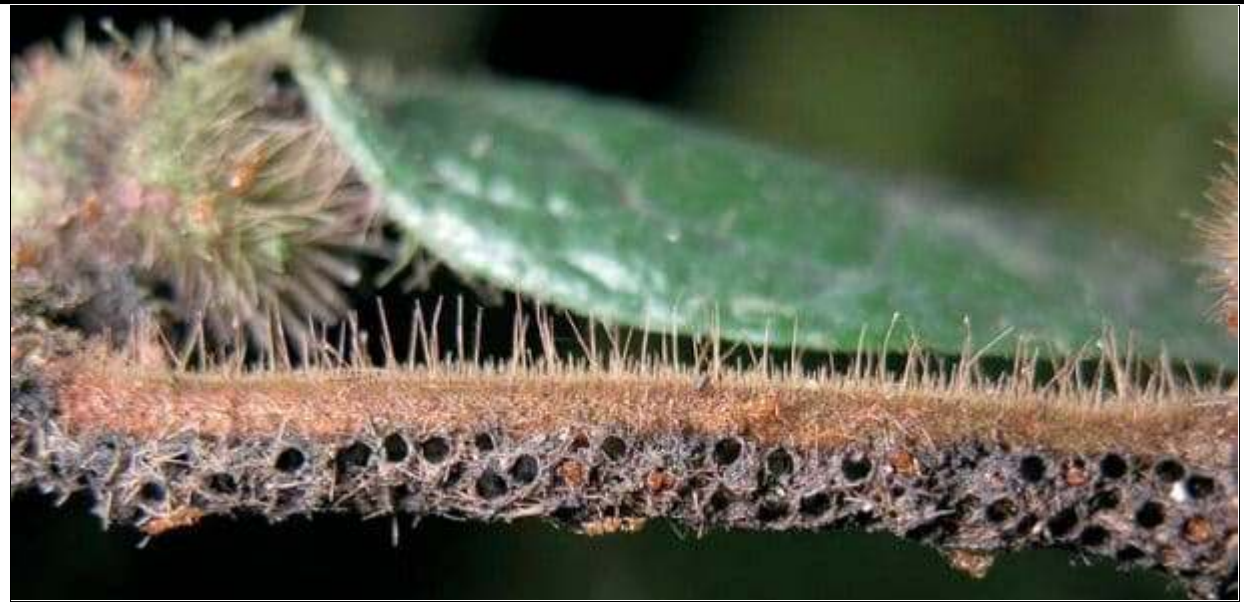
Allomerus trap.

A Newsletter for the People of God November 30, 2024 --- Issue No. 200